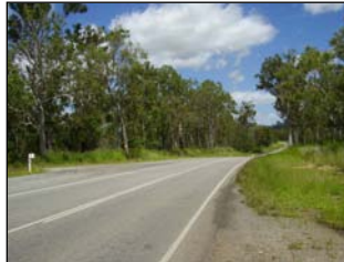
Peak Down Highway: Boundary Creek - Before

Widening of the pavement between Boundary