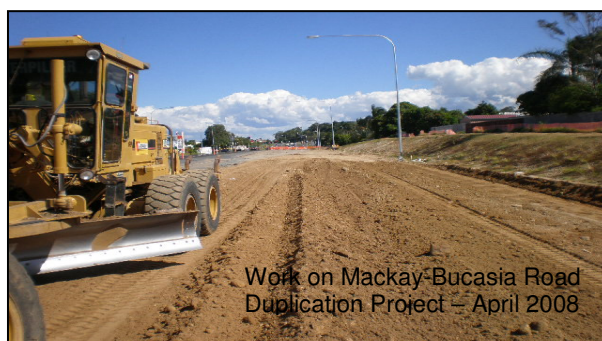
Work on Mackay-Bucasia Road Duplication Project – April 2008