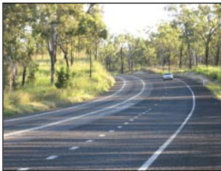
Peak Downs Highway: Boundary Creek - After

Creek and Cut Creek is due to be completed in May 2008 at a cost of $5.6 million. An additional $1 million dollars will also be spent on widening the pavement east of Bee Creek as part of the Safer Road Sooner program.