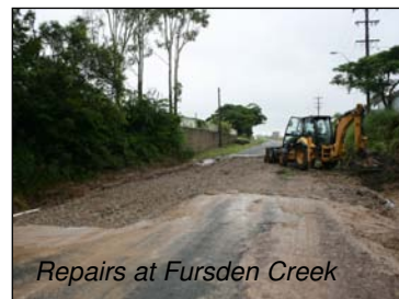
Repairs at Fursden Creek

Main Roads' officers and RoadTek crews were on site as soon as flood waters subsided to carry out emergency repairs. Only five days after the floods, access was restored to the entire Hospital Bridge/Fursden Creek road link.