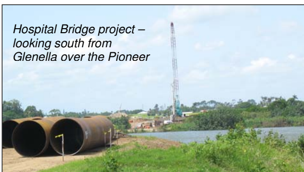
Hospital Bridge project – looking south from Glenella over the Pioneer

The upgrade of the Lagoon Street alignment was completed in August 2007 and work on the Lagoon Creek Bridge was finished in February 2008. Pile driving works on the main bridge structure are underway on the south side of the river. This involves driving steel liners and pouring concrete into the liners to form piles. A sand platform (bund) is being constructed on the northern side of the river to undertake pile driving works in the main stream of the river.