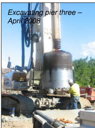
Excavating pier three – April 2008

The Hospital Bridge links the Bruce Highway at the southern entrance to Mackay City to North Mackay at Glenella. The bridge is an important commuter link in the Mackay Road network, especially during peak hour. The Hospital Bridge Replacement